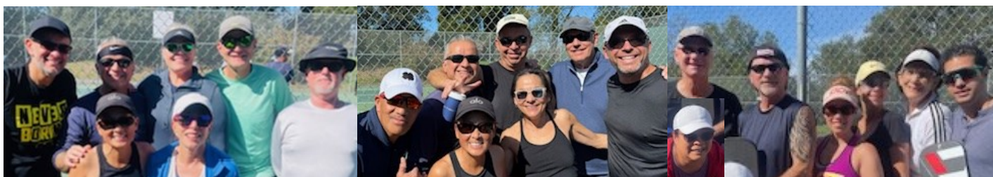
Some of our WCPC members looking pretty cool!

Many sports companies offer moderate to high-end priced eyewear. Around the Post recommends Gearbox Vision Eyewear ($40) for its slim fit and variety of colored lenses, and ONIX Eyewear ($35) with interchangeable colored lenses. If you can’t find something affordable, pull out a pair of safety goggles or punch out the lenses on an old pair of prescription glasses. For indoor play, get a pair of anti-reflective glasses to eliminate glare and make vision clearer - your eyes will thank you!