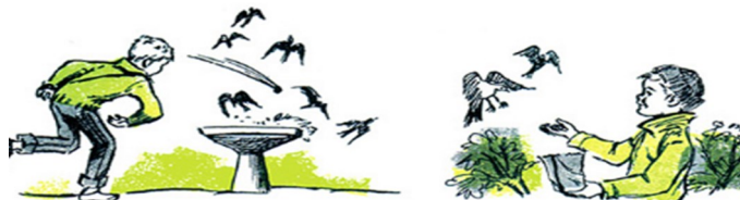
Goofus wildly throws the ball back.