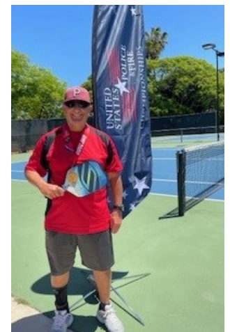
A golden smile win in 60+ Singles! 2021 US Police & Fire Championships San Diego, California